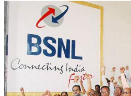
DoT's plans to deal with MTNL's debt come at a time when the govt is weighing the pros and cons of delisting MTNL and merging it into unlisted BSNL.

"There is no decision yet, but a possible option to deal with MTNL's dues in the run-up to any potential merger into BSNL is a sizeable long-tenure soft loan at 1-1.5% to the post-merger entity," a top government official aware of the matter told ET. He said such a soft loan would roughly be equivalent to MTNL's outstanding debt at the point of merger with BSNL. MTNL provides telecom services in Delhi and Mumbai, while BSNL offers the same in the rest of India.