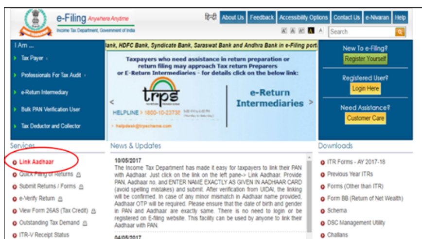
Figure 1: Linking Aadhaar with PAN on the Income Tax website

Taxpayers can go to http://www.incometaxindiaefiling.gov.in and click on the link on the Left Pane → Link Aadhaar , provide PAN, Aadhaar number and ENTER NAME EXACTLY AS GIVEN IN AADHAAR CARD (avoid spelling mistakes) and Submit. After verification from UIDAI, the linking will be confirmed.